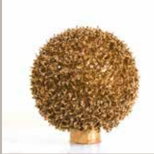
Silent Garden #4. To Survive. BH-Icones 3.