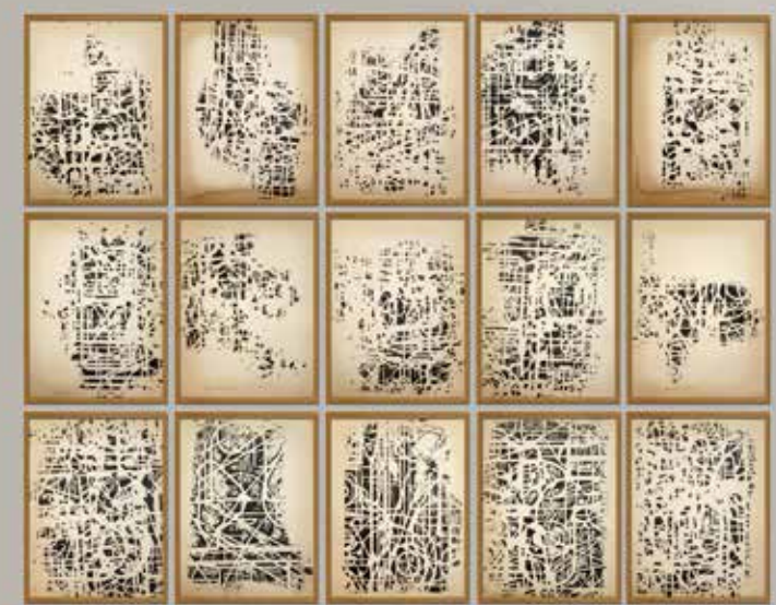
Mapping Nowhere #2, 2020, Woodcut print, 1/1, 75-year-old paper, 15 pieces, 23 x 32 cm each