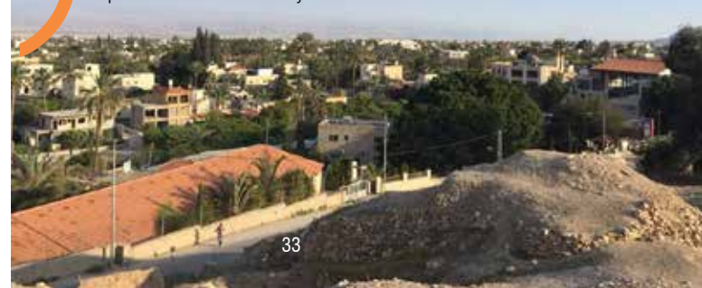
Tel al-Sultan, panoramic view of Jericho City.

Simply stated, Jericho is the city of gifts – nature, agricultural wonders, sunshine, and hospitable people. From all the nooks and crannies of the city, first-time visitors will hear a sincere "WELCOME TO JERICHO!"