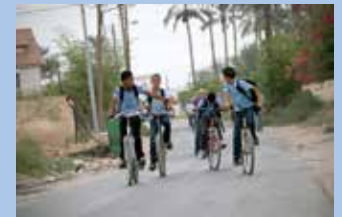
Children riding their bicycles in the streets of Jericho.