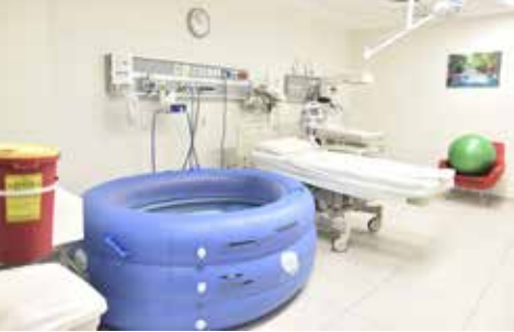
Labor room with pool for water birth.

With a new three-story building erected on the hospital grounds in Sheikh Jarrah (Jerusalem), 7,000 square meters and 75 beds (bringing the current hospitalbed total to 150), we are proud to bring high-quality, evidence-based, and compassionate care to women and newborns during pregnancy and childbirth.