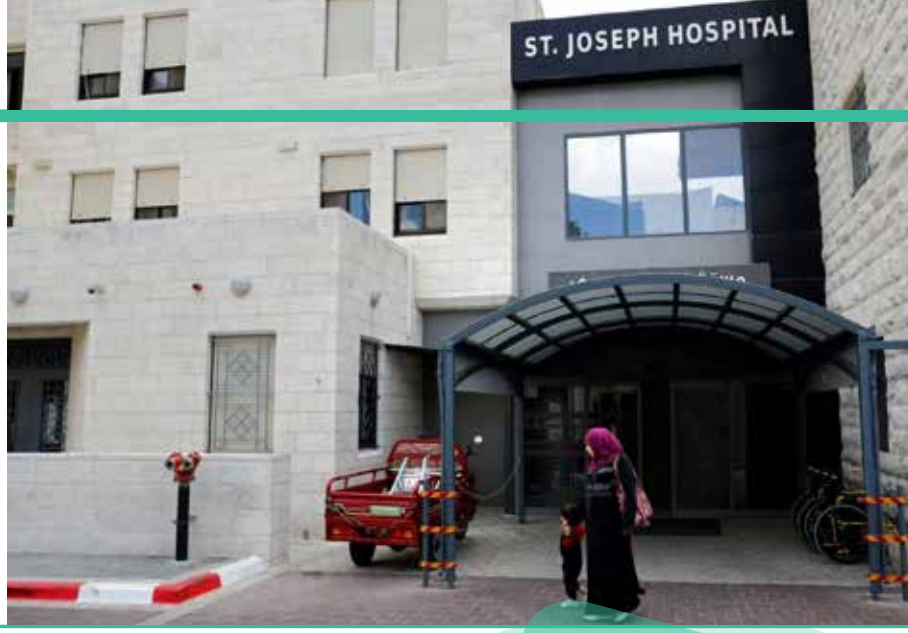
Main entrance of the hospital.

Our team of health care specialists provides professional medical services through distinguished and complex surgical procedures in thoracic, neurological, urological, and general surgeries that are followed up by professional, efficient, and evidence-based care (over 4.000 operations annually). Operations are performed in four fully equipped modern operating theaters backed with a special six-bed surgical, medical intensive care unit for constant and close monitoring.