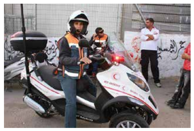
A special motorcycle ambulance can reach patients easily.

to emphasize the role of youth volunteers. Therefore, during the holy month of Ramadan each year, the volunteers intensify their work. They make high-profile appearances throughout the courtyards of the Holy Aqsa Mosque, guiding the people to the designated areas of prayer and directing them to alternative routes during times of congestion at the bottlenecks of the city gates. They