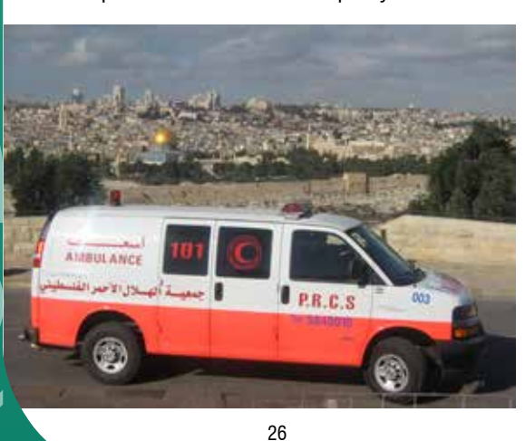
A Palestine Red Crescent Society Hospital ambulance on standby on the Mount of Olives in Jerusalem.

Red Crescent Society Hospital in Jerusalem offers high-quality and easily accessible health services in the field of women's childbirth, surgery, and intensive care for preterm children of Jerusalem and the surrounding areas. During the past decade, the average number of patients admitted monthly has increased from 250 to more than 300 at peak times. With a total capacity of 40 beds and a staff of