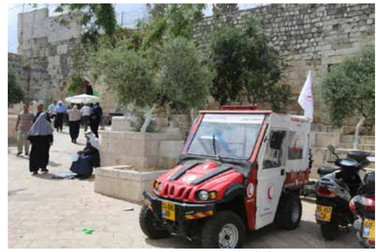
This ambulance is designed to navigate the narrow alleys of Jerusalem's Old City.

The Palestine Red Crescent Society's hospital is the center of the organization's activities in East Jerusalem.