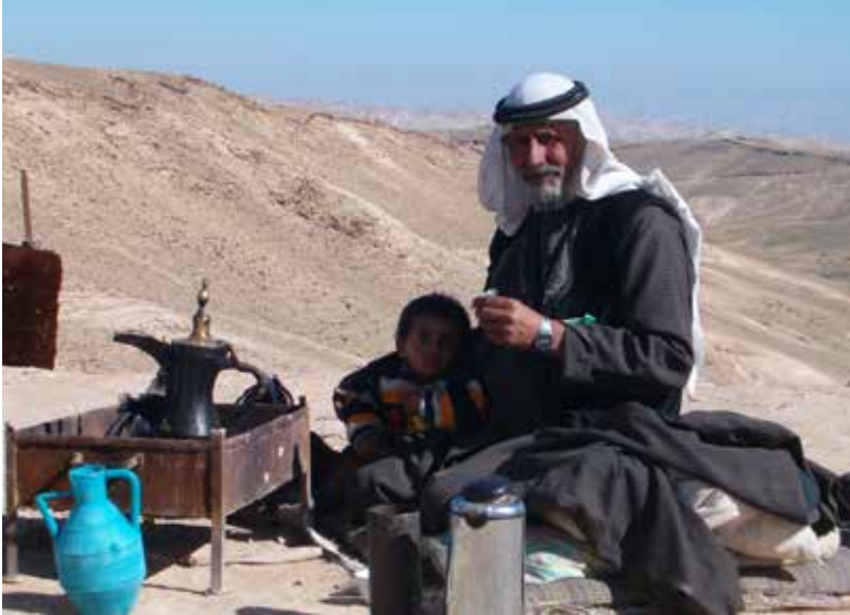
Disadvantaged Bedouin communities in Palestine are still based on strong patriarchal norms, and they have a high untapped potential for challenging gender stereotypes promoting a more active engagement of male members in childcare activities.

sheltering services, first and foremost with the establishment of the Mehwar Center in Bethlehem in 2007 and its ongoing support, to enhancing access to justice, promoting economic and social empowerment of women, and fostering a culture based on the respect of human rights.