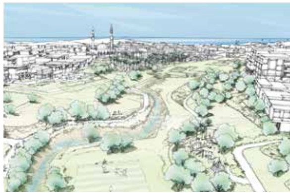
Artist impression for the key area in Gaza Vision, Wadi Gaza.