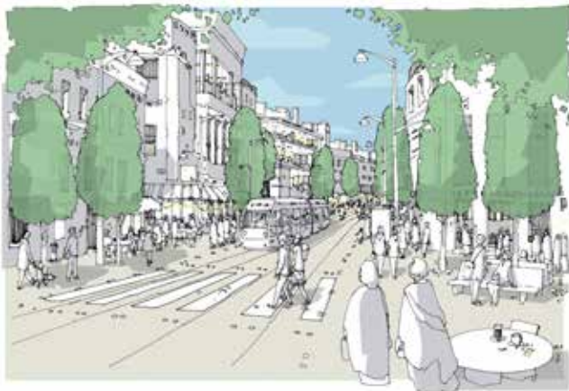
Artist impression for the key area in Gaza Vision, Core Gaza.

Local projects are smaller initiatives that support the delivery of the spatial vision. Some local projects are non-location specific and could be implemented in a variety of places across Gaza. Community programs, arts and heritage conservation, and the development of town centers are a few examples of this category. Proposed location-specific local projects comprise the waterfront generation of Gaza City, the regeneration of Gaza's old city and the Khan Younis town center, and the Mawasi tourism development initiative in Rafah.