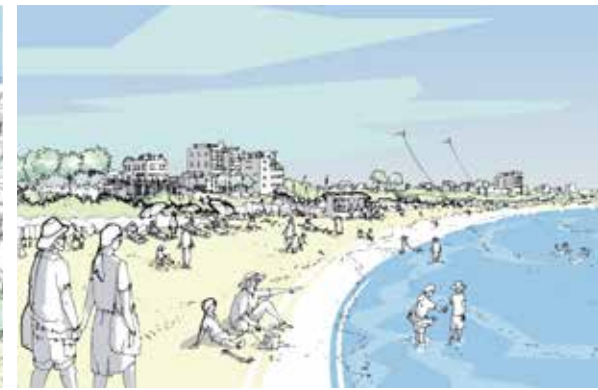
Artist impression for the key area in Gaza Vision, Beach Gaza.

The Global Palestine, Connected Gaza study was prepared by AECOM, one of the world's leading spatial and urban planning firms, in conjunction with The Portland Trust, which provided the economic context for the vision. The work was carried out in close coordination with a wide range of local and international stakeholders in Gaza and the West Bank. The resulting spatial vision proposes an integrated approach to four key elements that include urban development, transportation, energy and water, and the environment and open spaces. These key elements, in turn, provide an overarching framework for the implementation of what the study terms catalytic projects. Through these, the plan recognizes Gaza's pressing