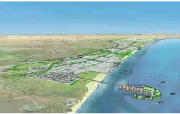
Artist impression for the key area in Gaza Vision, Gateway Gaza.