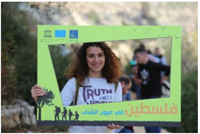
The sign says "Palestine in the eyes of youth."

Increasing community awareness of women's issues and rights will facilitate and speed up the implementation of policies as well. Raising awareness will mitigate resistance to any gender - and women responsive policies, and will raise individual and collective readiness to engage in efforts to achieve gender equality and equality. The women's