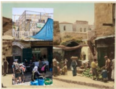
Al-Wad - Khan El-Zeit Junction

This body of work, exhibited at Gallery Anadiel at New Gate, is an attempt to encourage people, especially Jerusalemites, to reassess their relation to this city, reexamine it carefully, indulge in its details, and love it – not for what it was and what it symbolizes, but for what it can be. And as Mies van der Rohe put it so eloquently: “God is in the details.”