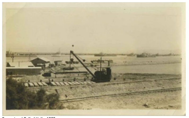
Seaport and Gulf of Haifa, 1929

able to establish four photography studios, located in Nazareth, Bethlehem, Haifa, and Jaffa. She drove her car from city to city, making her also one of the women pioneers in the Arab world to obtain a driver's license. She travelled to Lebanon, Syria, and Jordan on working missions, mostly shooting personal portraits. However, her work also documented towns with their churches and mosques, archaeological sites, and landscapes.