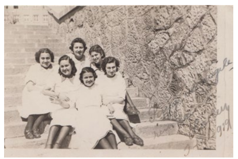
Nurses on training, Jerusalem, 1935.