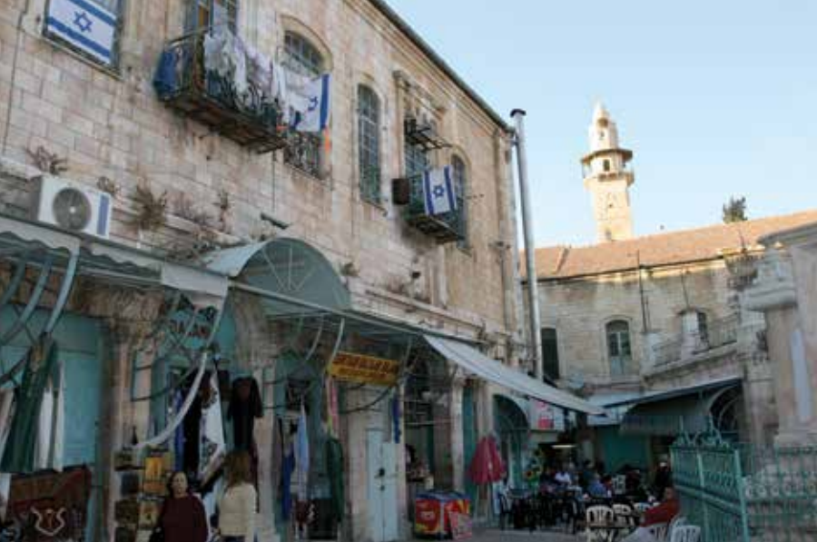
Settlers takeover in the Old City of Jerusalem.

Thus, Palestinian Jerusalemites are a uniquely traumatized community – living under extremely oppressive conditions and concurrently threatened with the revocation of the right to their homeland should they seek to escape said conditions. It is for this reason that many proclaim that simply remaining in Jerusalem is in itself an act of resistance against Israel's occupation.