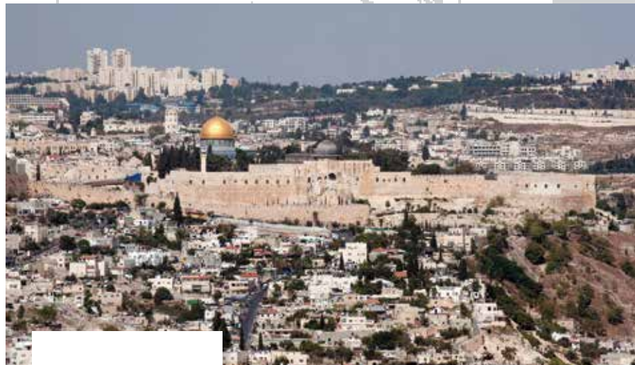
Jerusalem from the south.

Historically, Israel has worked to undermine the collective identity of Palestinian Jerusalemites since it first occupied the city in 1967. Over the past four decades, the state has implemented a complex network of measures that comprehensively work to minimize Palestinian presence in Jerusalem. These have included building-permit restrictions and home demolitions, the expansion of illegal Jewish