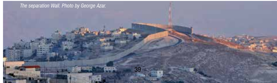
The separation Wall.