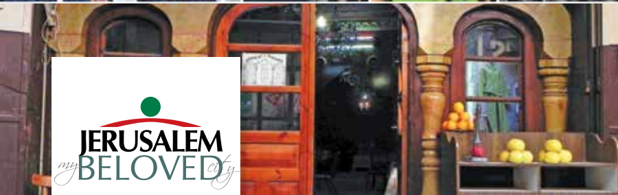
A coffee shop in Jerusalem.