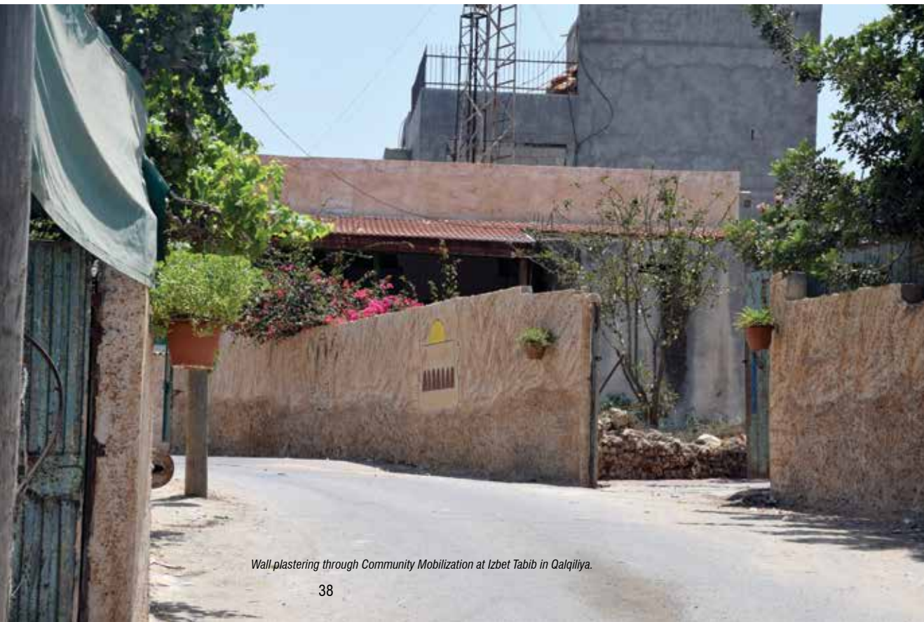
Wall plastering through Community Mobilization at Izbet Tabib in Qalqiliya.

UN-Habitat, as the UN agency for human settlements, is mandated by the UN General Assembly to promote socially and environmentally sustainable towns and cities with the goal of providing adequate shelter for all. UN-Habitat's programs are designed to help policy makers and local communities come to grips with the issues of human settlements and urban planning and to find workable and lasting solutions. In 2003, conscious of the special housing and human-settlements needs of the Palestinian people, and recognizing that they fall within the technical mandate of UN-Habitat, the Governing Council of UN-Habitat endorsed the establishment of the Special Human Settlements Programme for the Palestinian People (SHSPP).