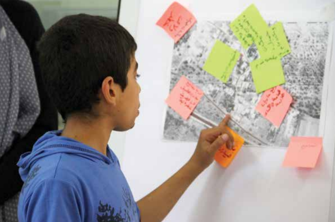
At one of the Local Planning workshops in South Hebron.

in 2011, including direct and indirect benefits, which translates into $800 million a year of additional tax revenues for the Government of Palestine. These numbers reflect the prevailing planning crisis in Area C and the squandered development opportunities that could be unlocked for the benefit of Palestinian communities.