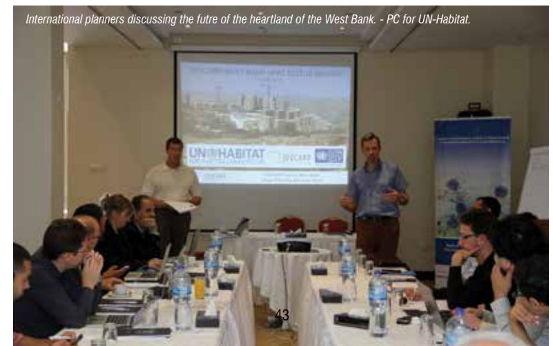
International planners discussing the future of the heartland of the West Bank.