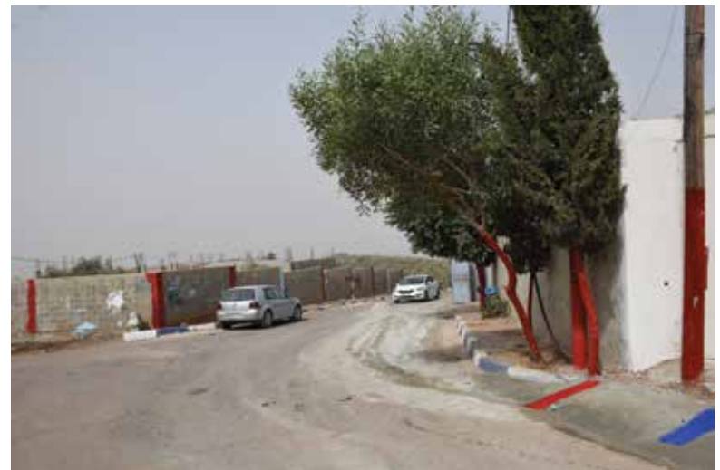
Coloring the curb stones of sidewalks through a youth initiative in Dab'a village.

Spatial planning interventions in the geo-political context of Area C are not rudimentary from the outset. The bulk of Palestinian communities in Area C are threatened by demolitions and displacement. According to official Israeli data, more than 11,000 Demolition Orders against ca. 17,000 Palestinian-owned structures in Area C have been issued. Furthermore, land delineations in Area C show sober realities in terms of planning inequalities: in 2014, plans for Palestinians targeted 0.4 percent of Area C land compared to 20.1 percent designated for illegal Israeli settlements. Area C is considered a cornerstone for the sustainability of Palestinian statehood. A World Bank report in 2014 showed that alleviating Israeli restrictions in Area C would generate a sum equivalent to thirty-five percent of the Palestinian GDP