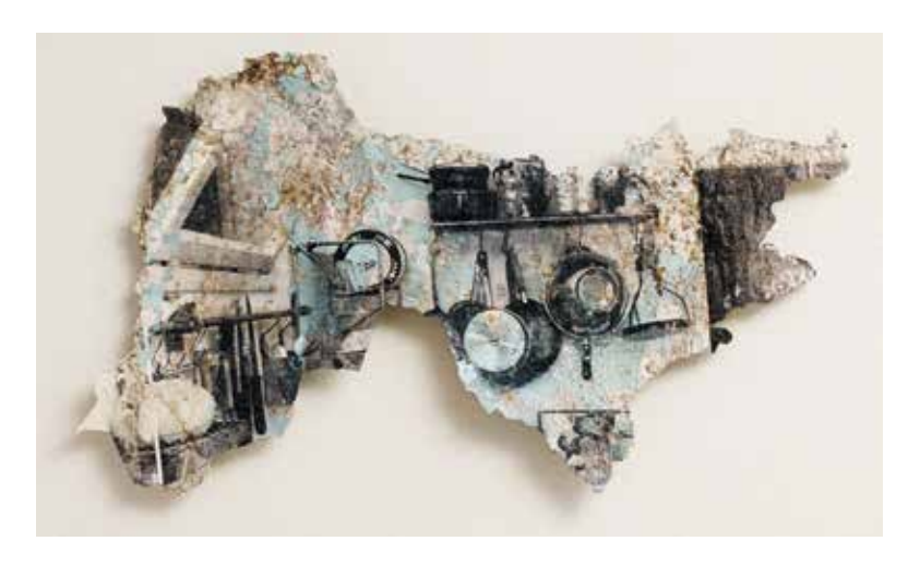
Top: 38 Days of Recollection, 2014, B&W film negatives (generated from digital images) printed with B&W photo emulsion spread on color part fragments collected from Jerusalem's Old City house walls.