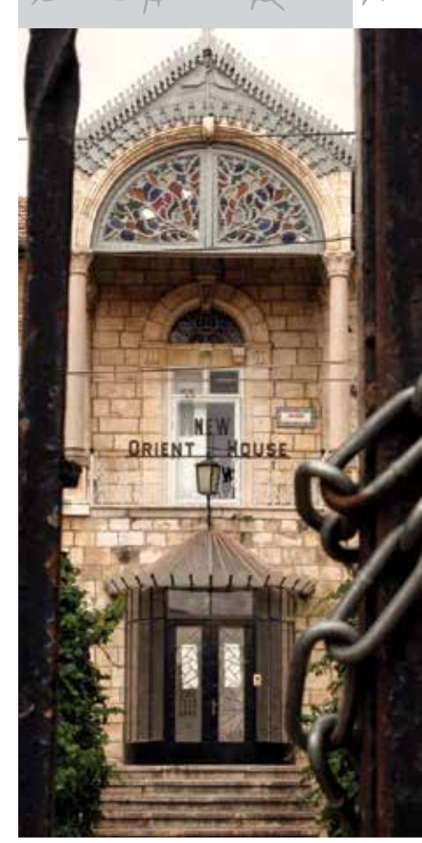
Orient House, Jerusalem.

During the first year of the first Intifada, 396 Palestinians were killed and more than 12,000 jailed; schools and universities were closed by the Israeli occupation authorities.