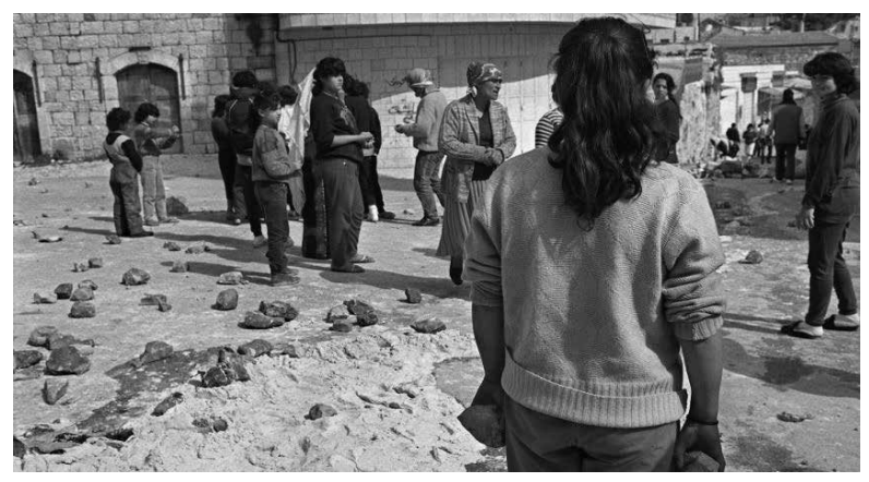
Scene from the first Intifada

of impending attacks by the Israeli army or settlers; women organized themselves in so-called "strike forces" to rescue arrested youth from the hands of Israeli soldiers; first aid committees were formed to treat the wounded; an alternative education system was established for each neighborhood to enable students to continue their education; and social committees were established to address the needs of the poor. Following the mass resignation in