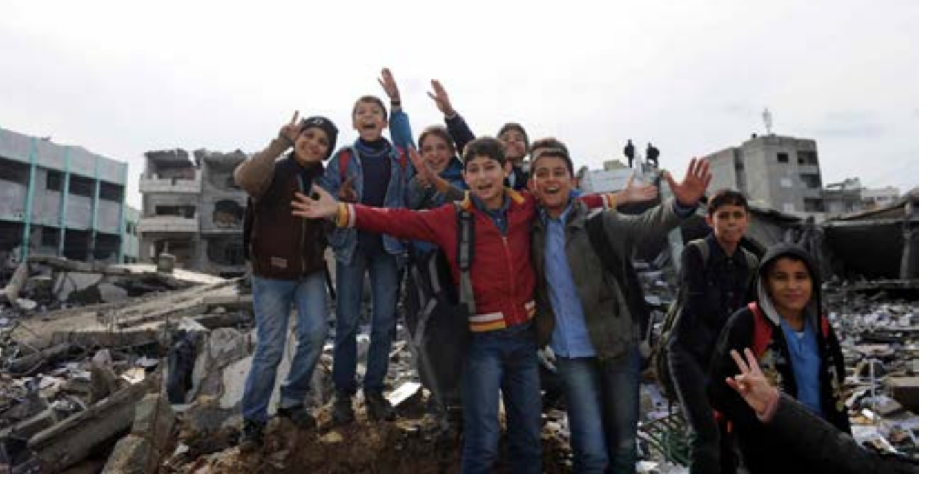
In 2017, the percentage of children (aged 0 to 14 years) in Gaza was close to 45 percent, youth (aged 15 to 24 years) made up over 21 percent.

Gaza has experienced a chronic electricity deficit for over a decade. severely disrupting the delivery of basic healthcare, water, and sanitation services, and undermining living conditions. Over the past two years. energy supply has further decreased, owing to a reduction of payments and subsidies from the Palestinian Authority for electricity and fuel needed to run Gaza's only power plant. This political wrangling between the PA and Hamas and the poor state of electricity infrastructure across the Strip has resulted in Palestinians in Gaza now living with some four hours of electricity per day.