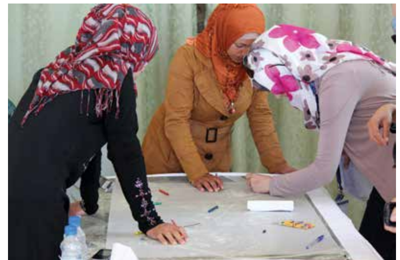
Placemaking Workshop.