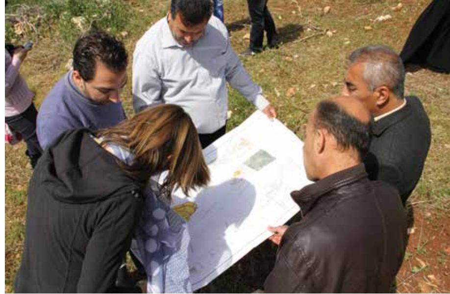
At a site visit in the Abdallah Younis village near Jenin.

By Asma Ibrahim and Pren Domgjoni UN-HABITAT