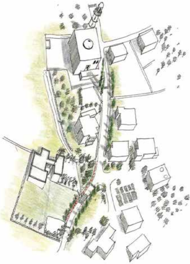
Figure 2 – Ras Al-Wad – Drawn by Jenny Donovan.