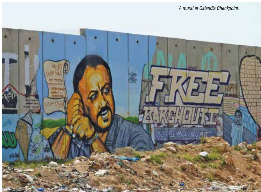
A mural at Qalandia Checkpoint.