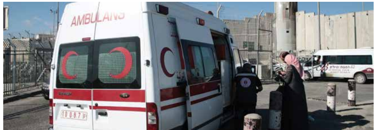
Ambulance at checkpoint.

While the first practice ensured that the “Residents of the Territories,” according to Israeli-government terminology, would remain sufficiently healthy and – more importantly – well-vaccinated so that they would not create epidemics that could also infect the Israeli Jewish population, the other five practices ensured that the Palestinian health system attained only minimal development, while the Israeli hospitals received the complex surgeries/medical cases. This meant that (a) Israeli hospitals were well reimbursed for their services from the