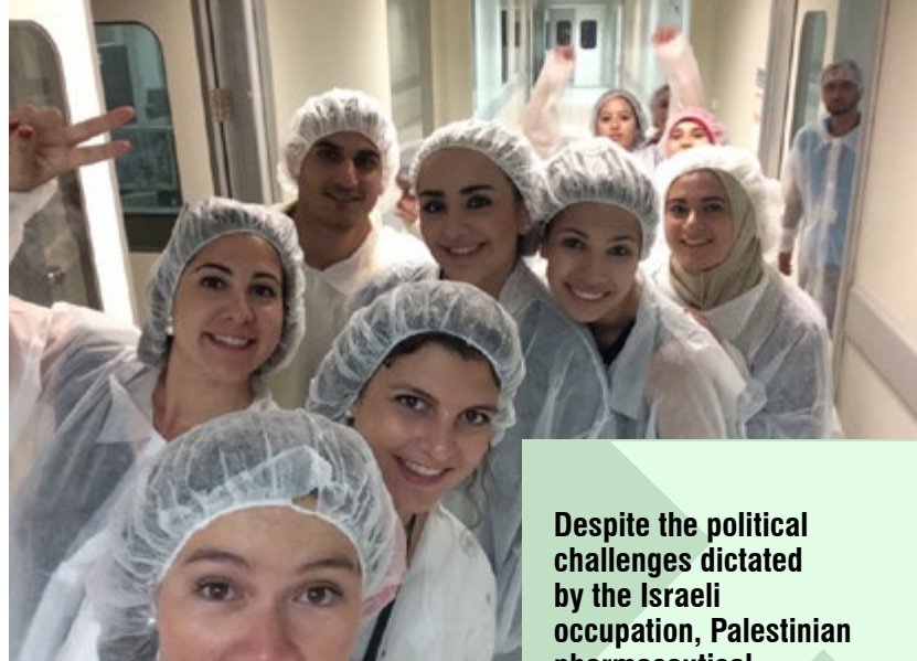
Birzeit Pharmaceutical Company workers.

The health sector in Palestine has recorded success in the elimination of contagious infectious diseases such as schistosomiasis, leprosy, diphtheria, plague, poliomyelitis, and rabies, and only a few cases that correspond to particular infectious diseases such as AIDS, hepatitis,