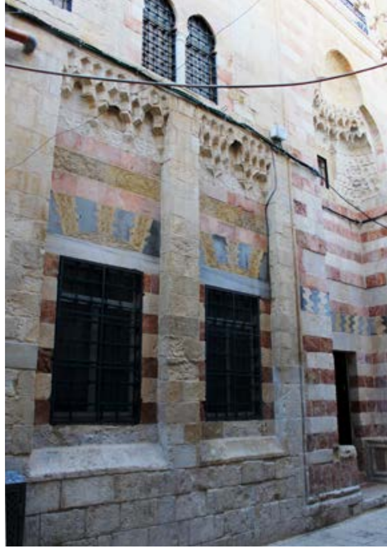
Red, white, and black masonry that courses the façade of Al-Madrasa al-Mazhariyyah, together with the ensemble of decorative mugarnas (beehive pendentives) and joggled interlocking stones, gives Mamluk Jerusalem its distinctive identity.