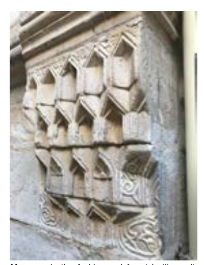
Muqarnas is the Arabic word for stalactite vault, often used to make a smooth transition from the rectangular base of the building to the vaulted ceiling.

authored various books, including Surviving the Wall, Before the Mountains Disappear, and Jerusalem in the Heart. A renowned oil painter, he has held numerous art shows. He may be reached at aqleibo@yahoo.com.