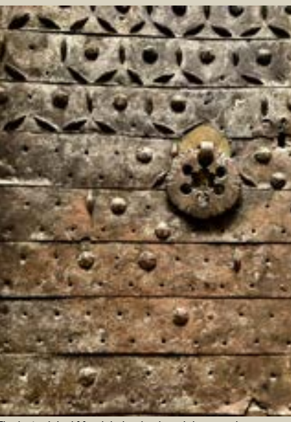
The last original Mamluk doorknob and door survive at Al-Madrasa al-Salamiyyah in Bab al-Malek Faisal.

Protected tenants with long-term leases have turned into owners who appropriate the monuments, adding their shacks, extending their authority, and screening the visitors. Ironically, though these Ayyubid, Mamluk, and Ottoman monuments, as infills on Crusader,