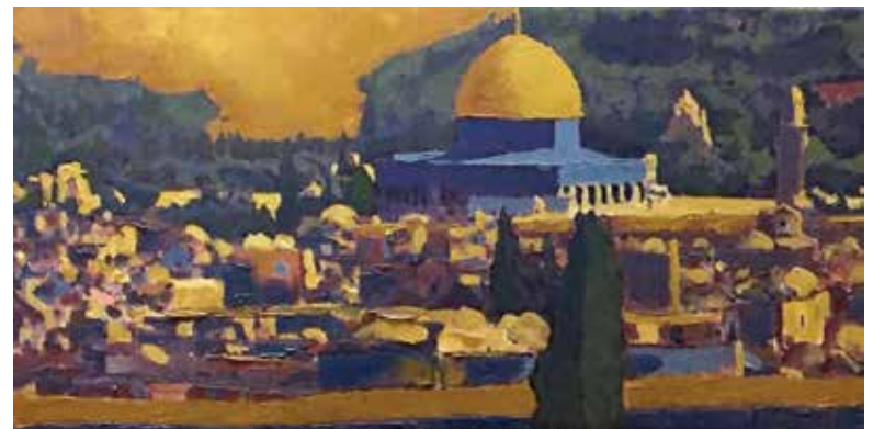
Mysterious Winter Light.