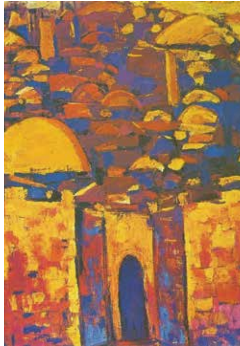
Damascus Gate abstracted.

and internationally, have made him a well-known public figure. He has served for over seven years on the board of trustees of the YMCA in West Jerusalem. During the past 15 years – and in conjunction with Al-Quds University Research Center and St. George College – he established the itinerary for Muslim tourism in Jerusalem and diverse heritage tours